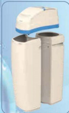
Removable brine tank with sliding salt lid

*Compared to conventional calendar clock models