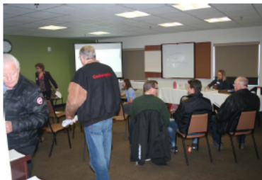
March 8, business owners and community members met with the RM's planning team and members of council to discuss naming the business district on the north side of Highway 1 within the RM.

snowmobilecourse.com, sasksnow.com, www.sgi.sk.ca/atv-and-snowmobile and www.sgi.sk.ca/legislation