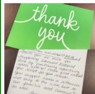
A thank you card received by the RM for a donation provided to the Edenwold Memorial Link