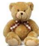
Toys and Clothing