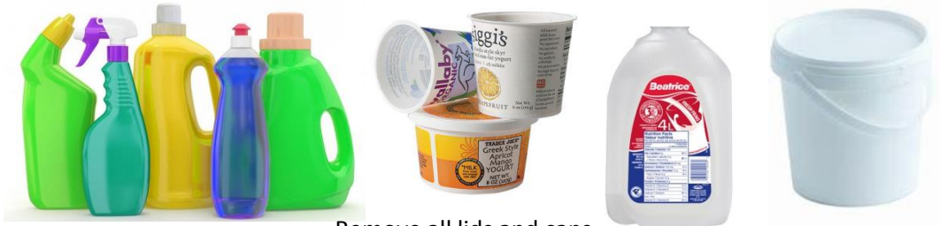
Remove all lids and caps