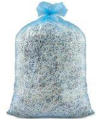
Shredded Paper in clear bags