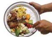
Food and Garbage