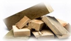
Wood and Metal Scrap