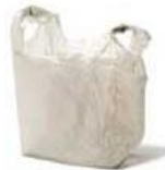
Plastic Bags and Stretch Wrap