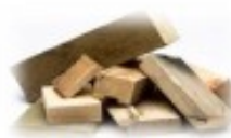
Wood and Metal Scrap