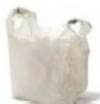
Plastic Bags and Stretch Wrap