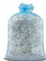
Shredded Paper in clear bags